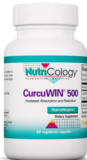
#57290 60 vegetarian capsules

CurcuWIN® has significantly higher absorption compared to other curcumin ingredients. In a well-controlled human clinical trial, the first curcumin study of its kind to compare commercial curcumin products, CurcuWIN® increased relative absorption of total curcuminoids 46-times over standard curcumin. CurcuWIN® also has longer-lasting action with higher serum concentrations after 12 hours.* CurcuWIN® curcumin uses a molecular dispersion process (UltraSOL technology) which converts oil soluble nutrients into water-dispersible ingredients to enhance bioavailability and retention.*