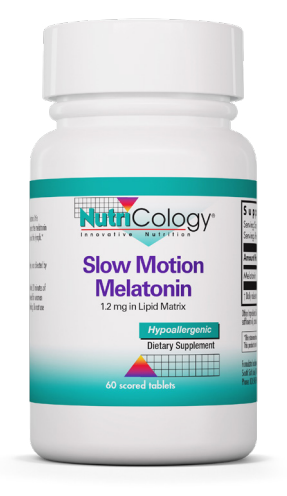
#52231 60 scored tablets

Poorly prepared modified release preparations can keep melatonin in the system for many hours after wakeup, resulting in carry-over "hangover" effects. Such unnatural presence of high melatonin levels during the day can lead to phase-delay in the circadian clock and potentially make sleep problems even worse.