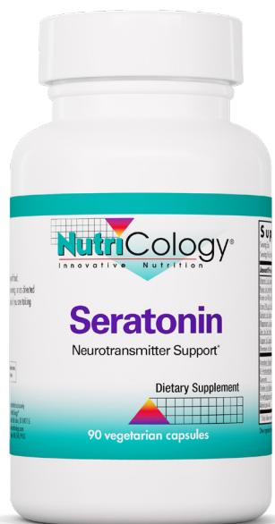
#56020 90 vegetarian capsules

Seratonin is a patented nutritional formula designed to enhance healthy moods and sound sleep.* Seratonin™ contains a combination of nutrients formulated to support a balance of two key brain neurotransmitters, norepinephrine and serotonin.* Additionally, the formula provides nutritional support for blood sugar within normal levels.*