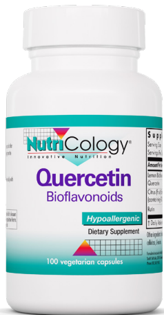
#50050 100 vegetarian capsules