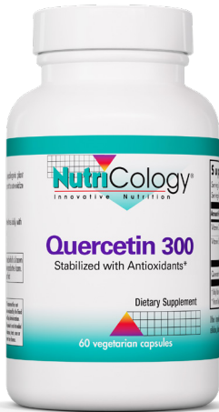
#50060 60 vegetarian capsules